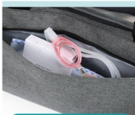
Dry/Wet Separation Design