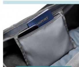
Soft pocket for valuables

It adopted sturdy and smooth zippers, making it easy to slide. It equipped with a digital lock, which helps ensure your personal items are safe.