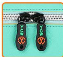
RUBBER ZIPPER PULLER