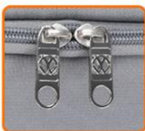
METAL DEBOSSED ZIPPER PULLER