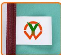
WASHING CARE LABEL