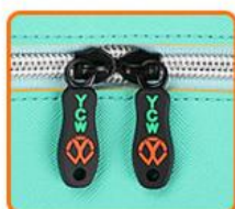
RUBBER ZIPPER PULLER