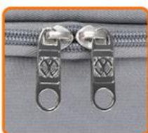
METAL DEBOSSED ZIPPER PULLER