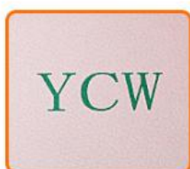
SILK SCREEN PRINTING