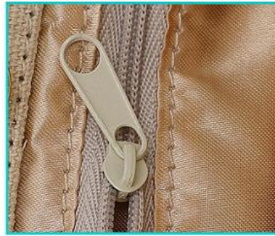
Internal zipper pocket