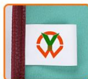
WASHING CARE LABEL