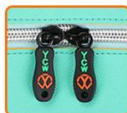
RUBBER ZIPPER PULLER