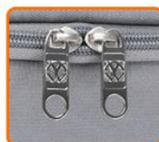
METAL DEBOSSED ZIPPER PULLER