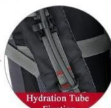
Hydration Tube Fixation