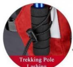
Trekking Pole Lashing