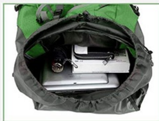
Special closing drawstring design