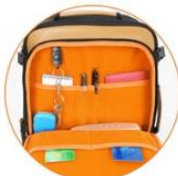
Large capacity compartments